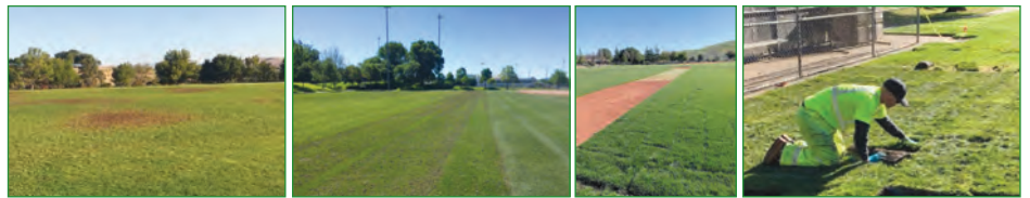
Old Ranch Park

define the edge, as needed. The amount of infield material at each site is assessed and added to maintain a safe playing surface. Sports turf is aerated and de-thatched, after which seed is added and topdressed.